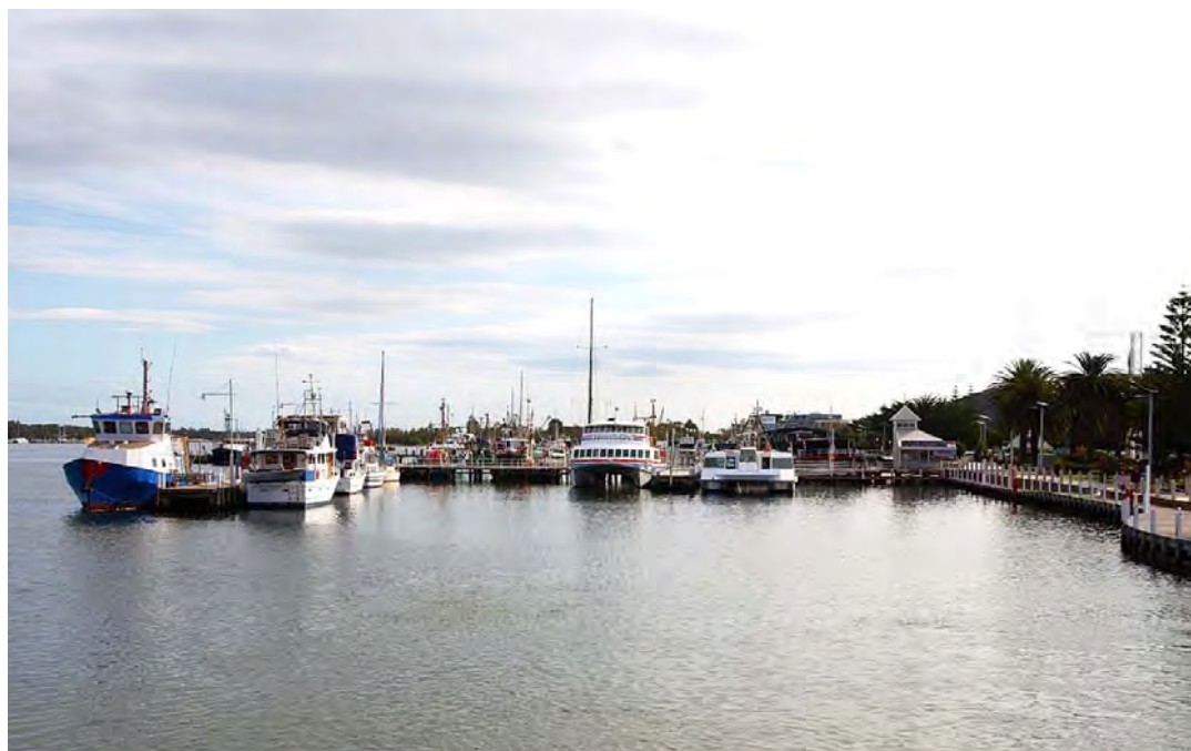
Lakes Entrance jetty resplendent with fishing boats