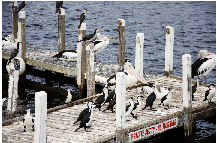
Photo of the actual Lakes Entrance Photo of Lakes bird life