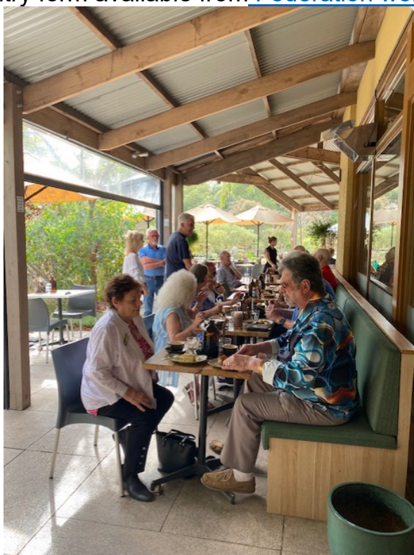
ABCCC members at Kuranga Nursery