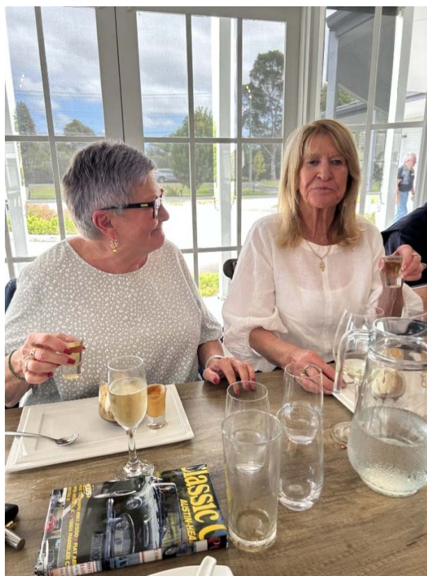
Hastings Run