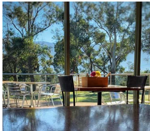
Upper Yarra RSL