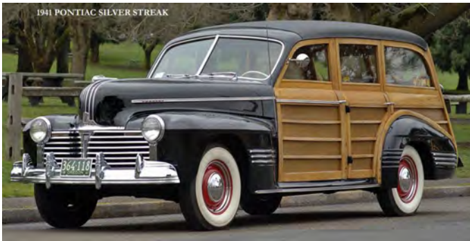
1941 PONTIAC SILVER STREAK