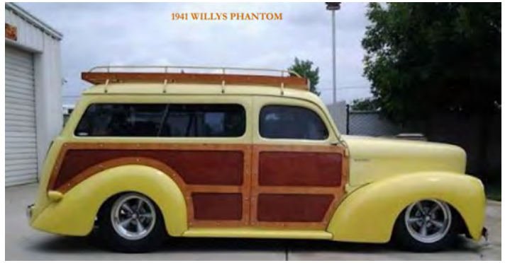
1941 WILLYS PHANTOM