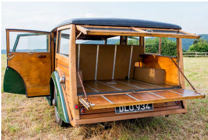
The clamour for fuel rations led to some sporting models being given the timber treatment, such as this 1937 Bentley 4¼-litre

Wood frames were frequently used by coachbuilders of limousines and sports cars, although it was often wrapped in cloth or leather rather than left bare.