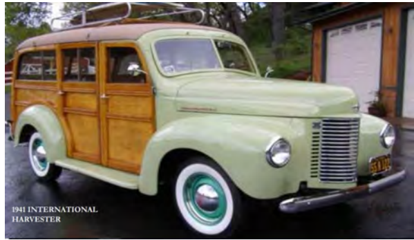
1941 INTERNATIONAL HARVESTER