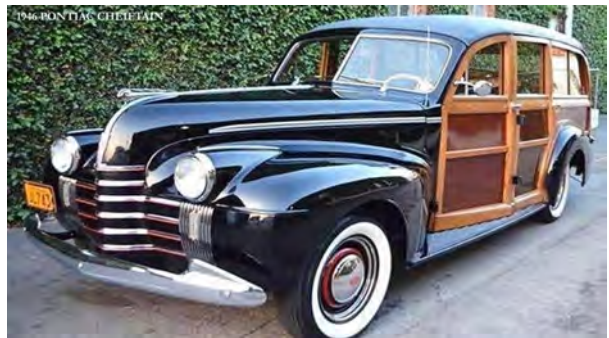
1946 PONTIAC CHIEFTAIN