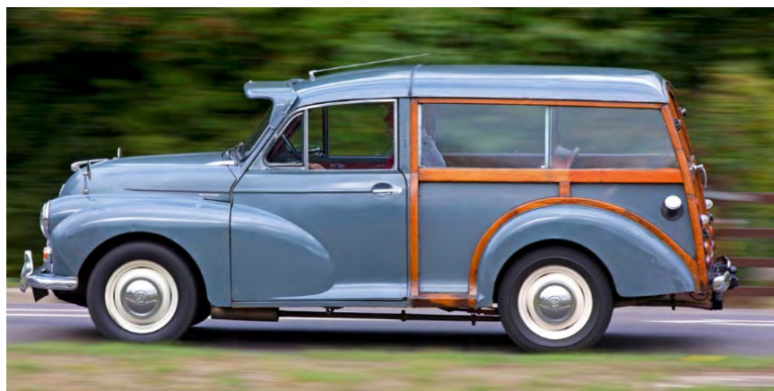
The first shooting brakes were built on luxury chassis, such as this 1926 Rolls-Royce 20hp by Hooper

The names these vehicles took on either continent reflected their origin, the 'station wagon' of the States connected America's leisure hotels with the rail network; in Britain, the 'shooting brake', or later 'estate', would transport hunting parties around the country piles of the wealthy.