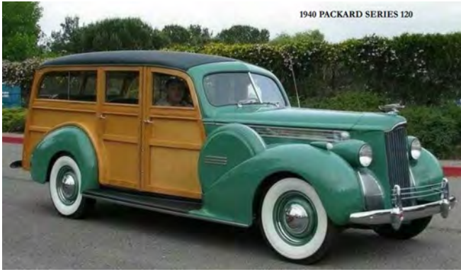
1940 PACKARD SERIES 120