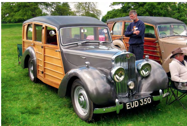
The Lea-Francis 14hp became a favourite for conversion into a shooting brake in the late 1940s, built first by companies including Jensen Motors and the Southern Caravan Company, before work was moved to Lea-Francis' main body supplier, APA

The aftermath of the conflict and its resulting steel shortages meant a heyday for the British woodie in the late '40s and early '50s.