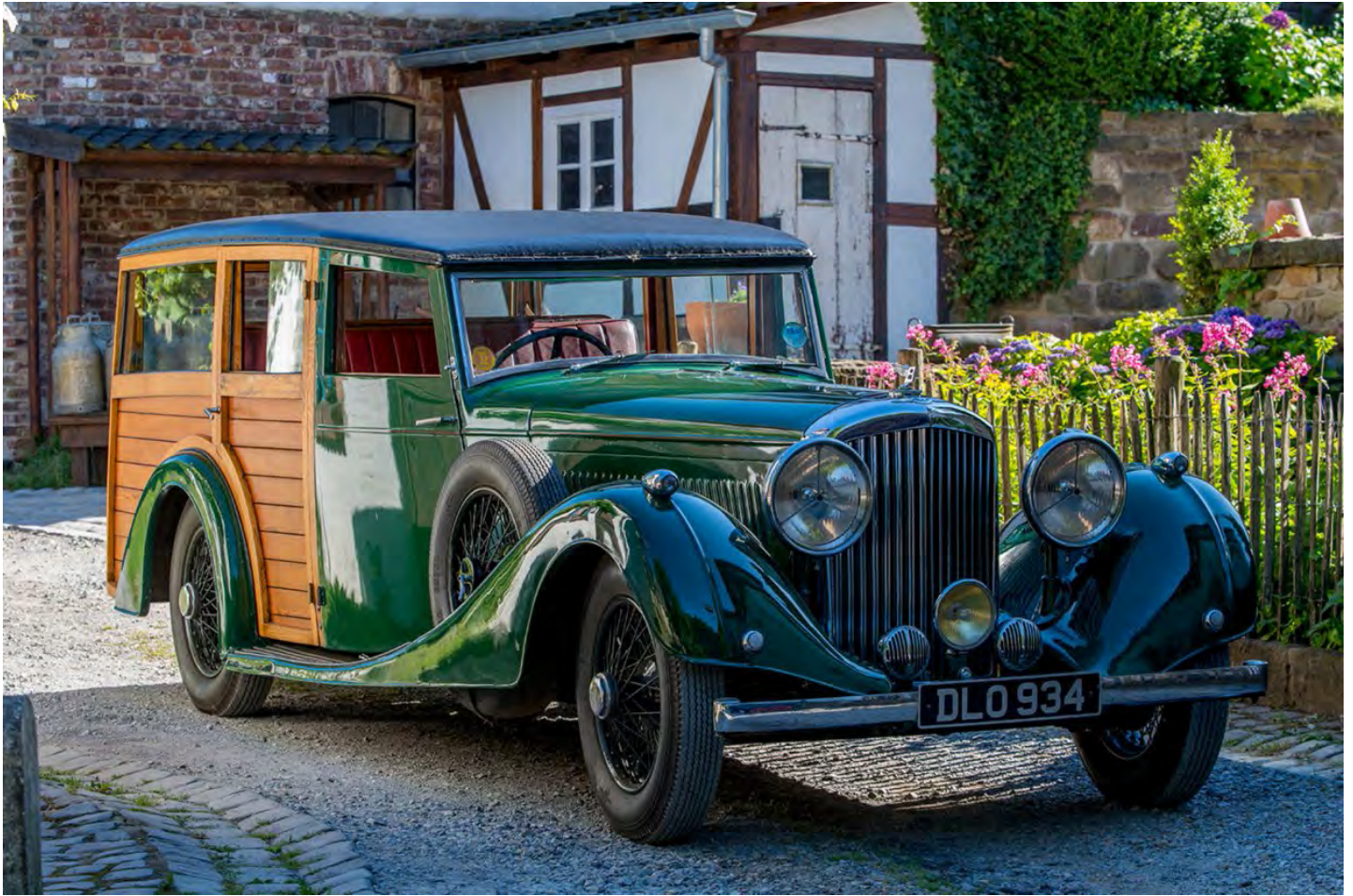
Vincents of Reading converted this 1937 Bentley 4 1/4-litre into a timber-clad estate in 1949

A convenient tax break – woodies were classed as commercial vehicles – helped with their popularity, but WW2 would prove the real making of the British woodie.