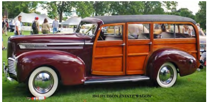
1941 HUDSON ESTATE WAGON