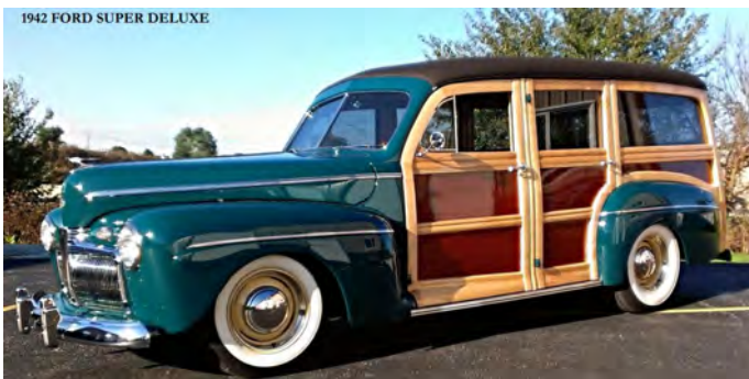
1942 FORD SUPER DELUXE