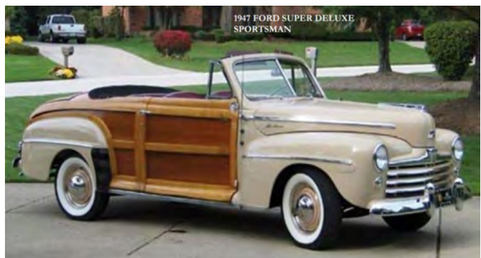
1947 FORD SUPER DELUXE SPORTSMAN