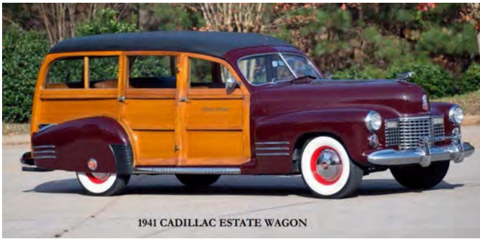
1941 CADILLAC ESTATE WAGON