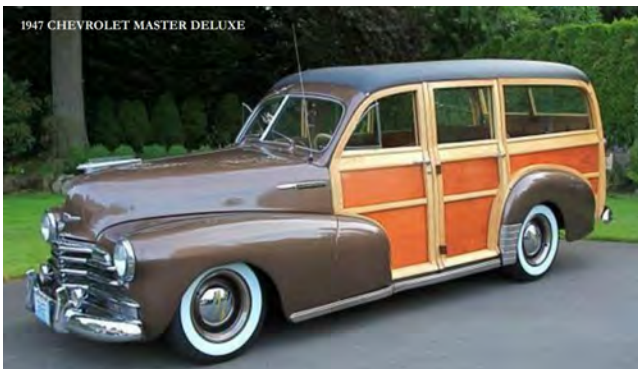
1947 CHEVROLET MASTER DELUXE