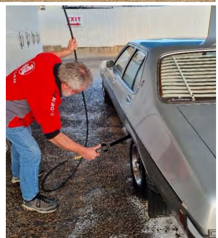
After the drive on the hills on the mud tracks and slippery grass after visiting the woolshed on the Clunie Property it was a quick trip to the car wash to remove all the mud.....