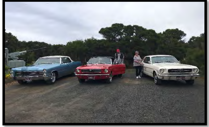
USA cars made interesting mix with the Brits along the way!