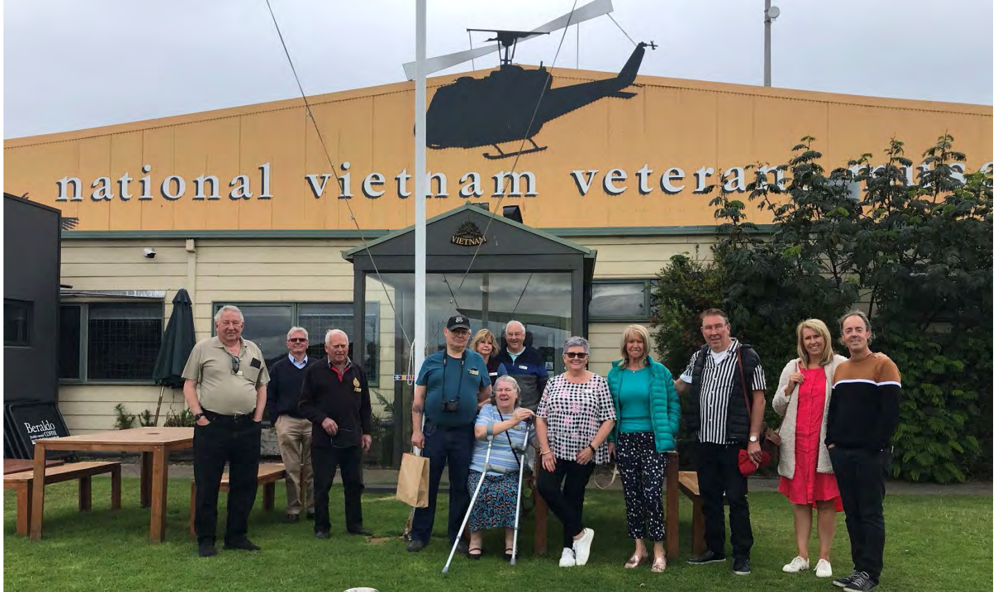
Please note the Napoleonic stance of our president with attack chopper at museum

13 intrepid members enjoyed a great day starting at Caldermeade Dairy, visiting National Vietnam Museum and culminating in lunch at Cowes RSL. The rain held and highway ran free today.