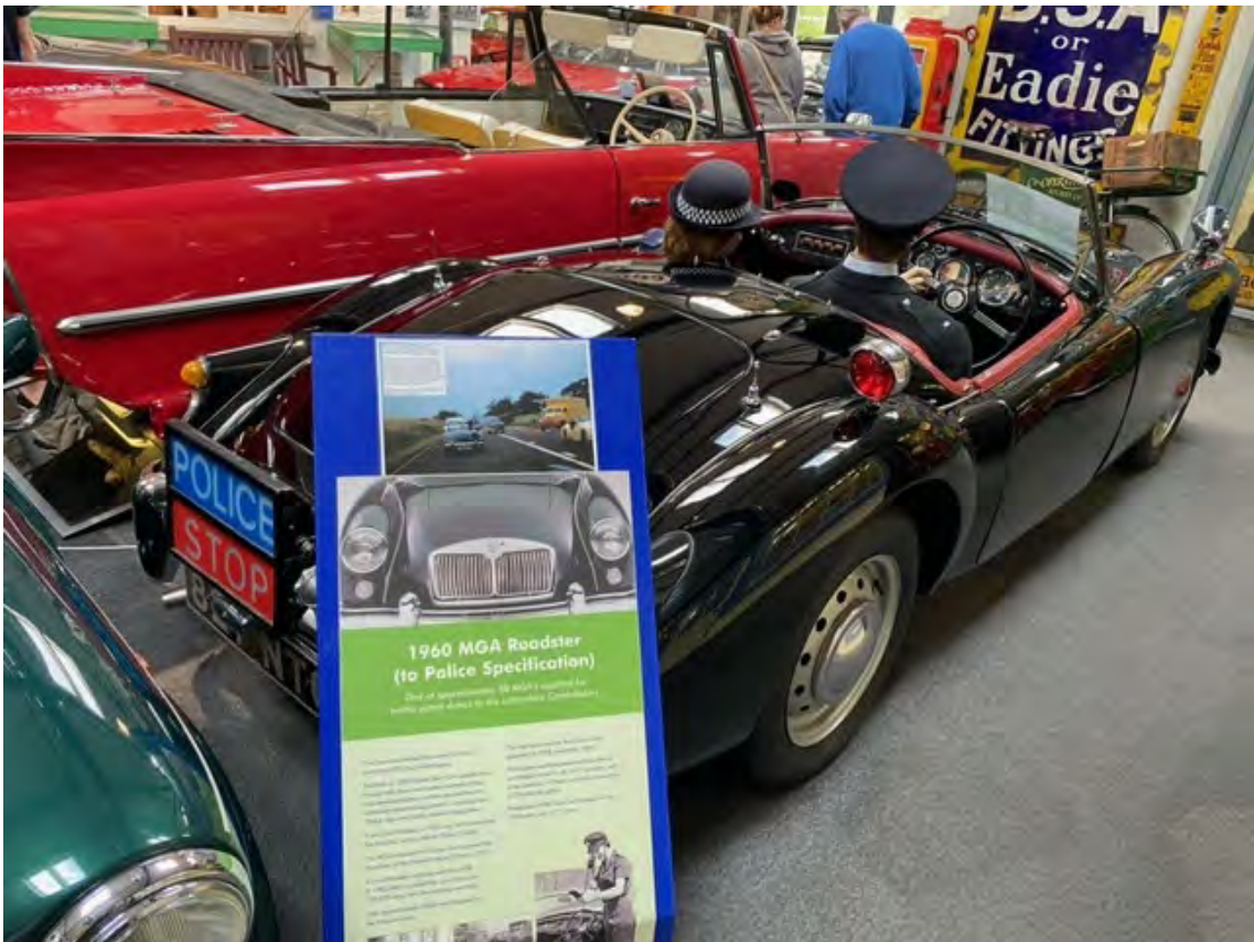
This 1960 MGA Roadster, on display at the Lakeland Motor Museum, was one of around 50 supplied to the Lancashire Constabulary for traffic patrol duties around the county. It's thought they were almost exclusively driven by female police officers.