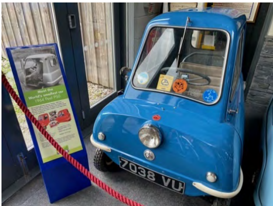
Above the World's Smallest Car - Peel P50 The P50 was originally produced by the Peel Engineering company on the British Isle of Man from 1962 to 1965. Each car was handmade and only 50 of them have ever seen the light of day. It is a three wheeled car with only one door, one seat, one headlight and one windscreen wiper. It was marketed as a car that could carry one person and a shopping bag, and it could barely hold that much, weighing just less than 60 kg.