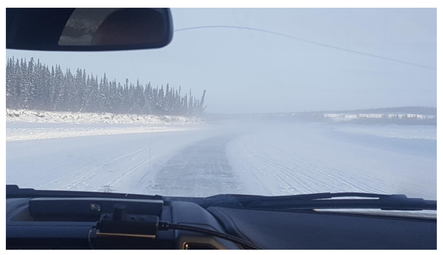
Navigator's view driving along the northern river ice road.