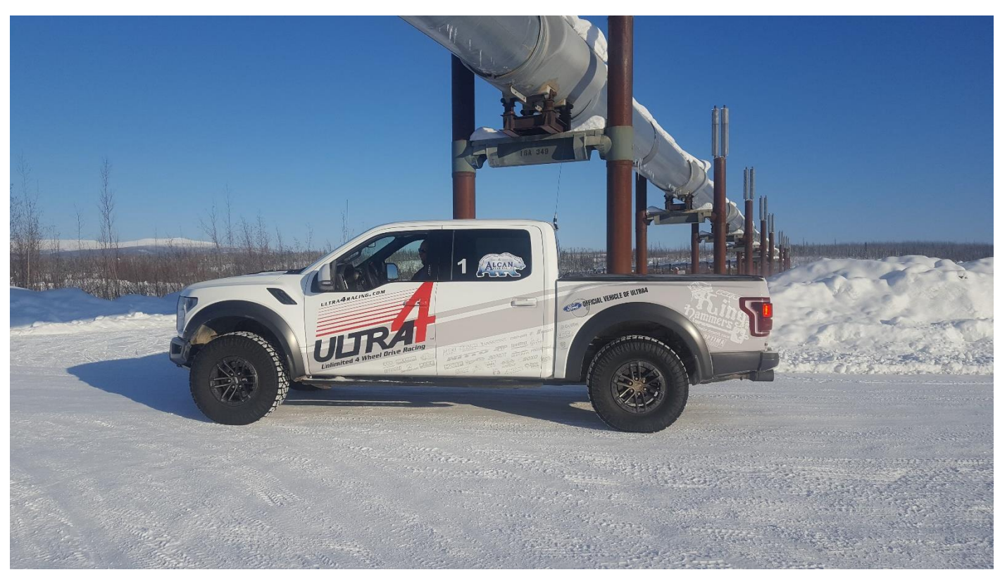
The Alcan 5,000 V5 with the Ford Raptor parked beneath the Alaska Pipeline – Photo P Schneider.