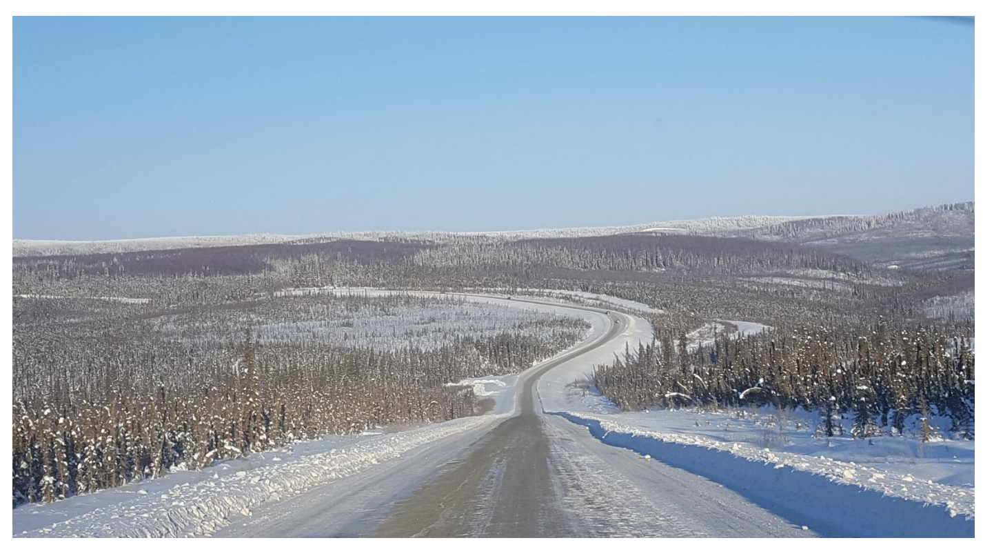
You drive over a rise, a grand scene appears and the big music really rises (suggest 'From The New World' Symphony, by Antonín Dvořák), a resounding rendition is called for, what a drive inspiring view!