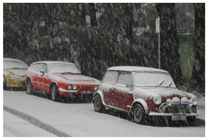
The Cream Sponge Run, 2008. Our best ever event?