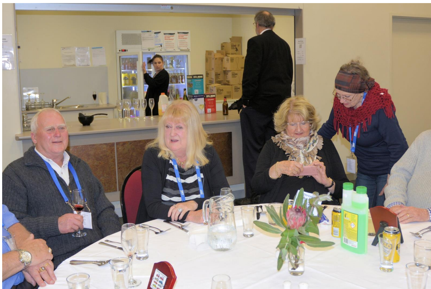
Memories of the Hamilton Rally