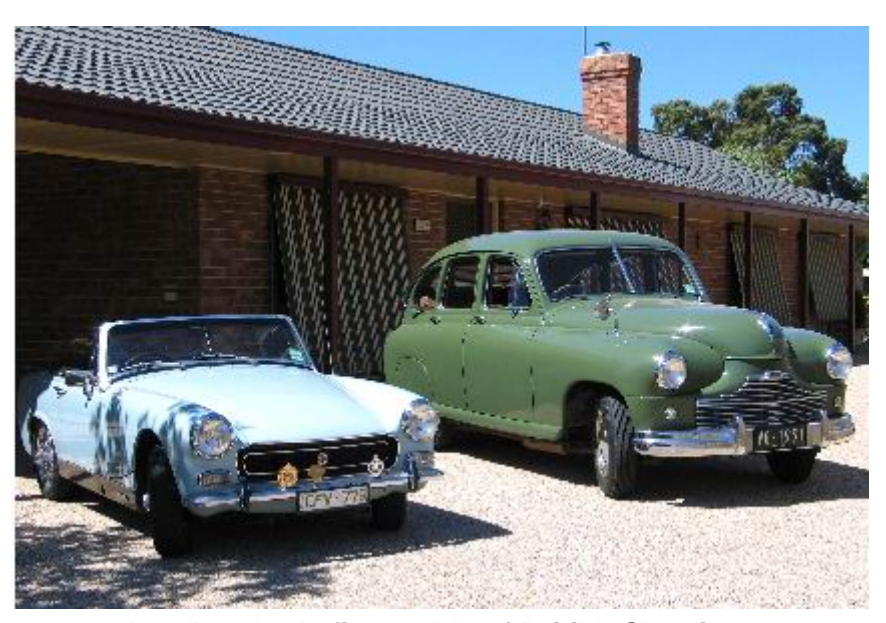
Len Butcher's fine stable of British Classics. A delightful MG Midget and one of the old favourites – a Standard Vanguard.

Please send in photographs of your British Classic so that it can be featured here – otherwise, definitely more Jowett pictures!