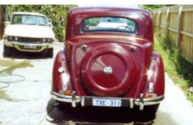
That classic Rover boot lid.