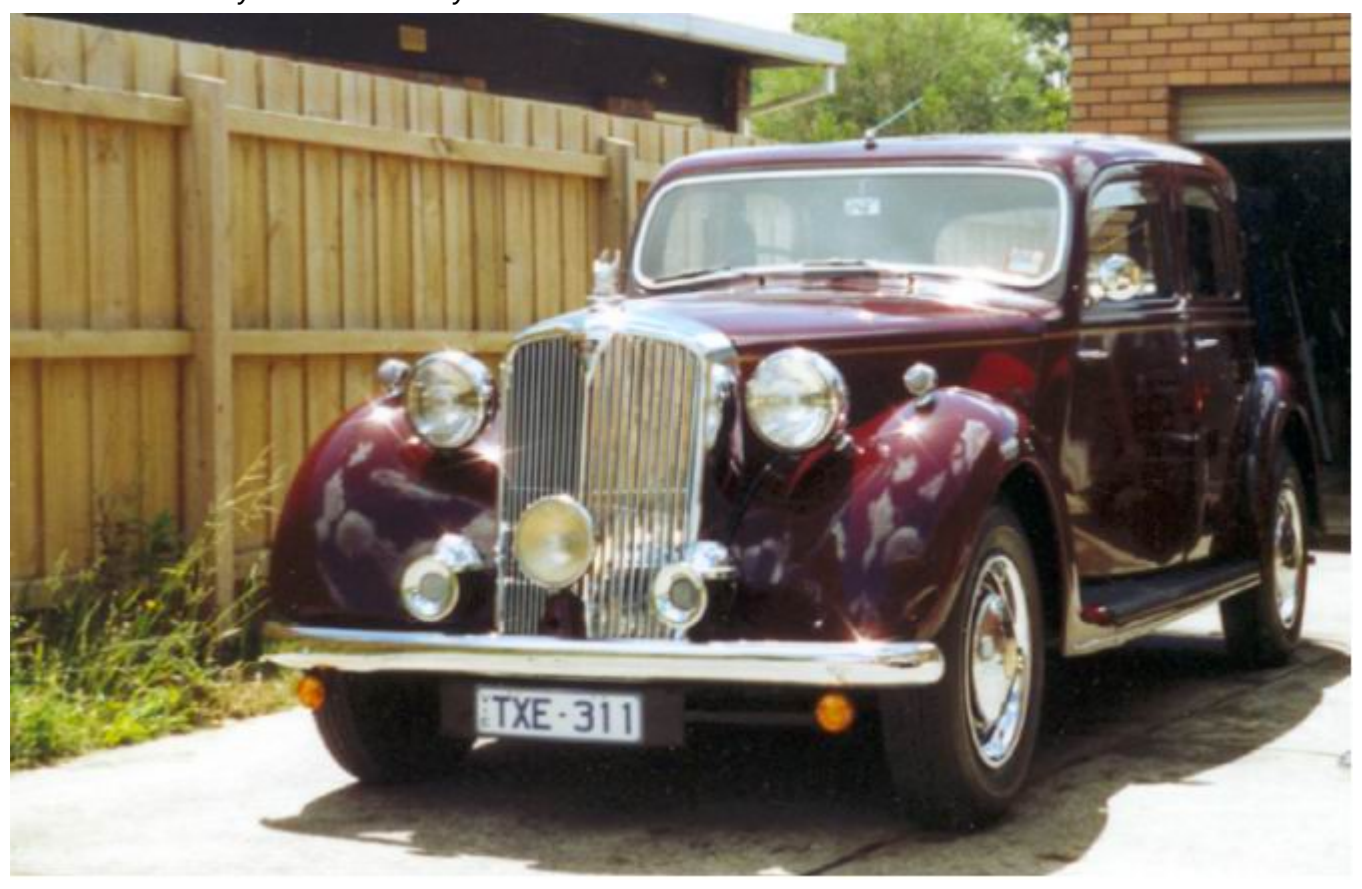
A truly beautiful sporting saloon – the Rover '75'.