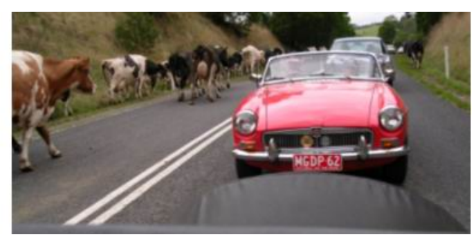
Some unexpected admirers of our cars en route!

Once again the admirable organisational capabilities of our club came to the fore. Jim and Val had a listing of our motel room allocation, and it was convenient to simply drive in and park, then check in at our leisure and relax before our dinner appointment.