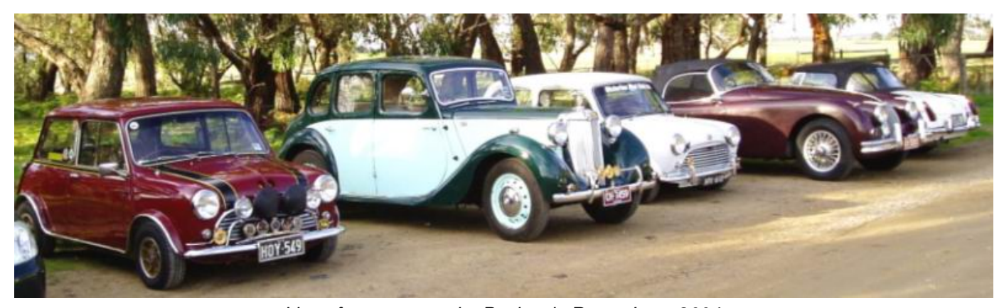
Line of cars on popular Peninsula Run – June, 2004.