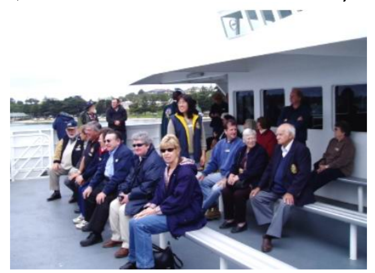
Page 9 of 14

Our crossing was in brilliant sunshine, with a moderate swell, ( mal de mer time, right ) and took about forty minutes. Our charabanc was first off the ferry in Queenscliff and we had the entire ferry's worth of traffic following us to our lunch venue. Here tables were reserved for us and, right away, cool drinks were the order of the day. It was soon discovered that the hotel's Lindsay had done a bunk – very likely because the lambs Your ABCCC News – December, 2004