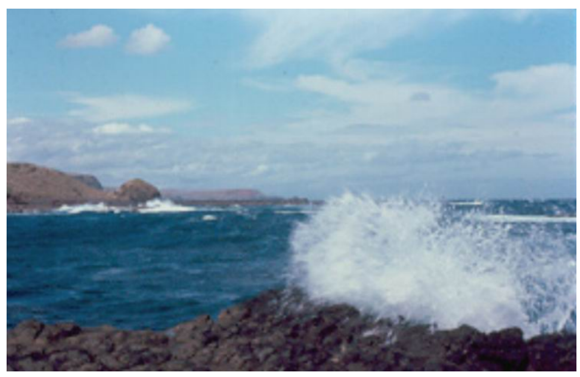
The beautiful Phillip Island Bass Strait coast, looking towards Cape Woolami.

Let's start the new year's events for the ABCCC with an interesting and entertaining weekend in the Gippsland and Phillip Island area. On the Saturday morning we will meet at 10:00 am at Caldermeade Farm, approximately 15 kilometres southeast of Tooradin on the South Gippsland Highway (M420), where we shall partake of Devonshire Tea or coffee. We will then take a scenic drive to Wonthaggi for lunch.