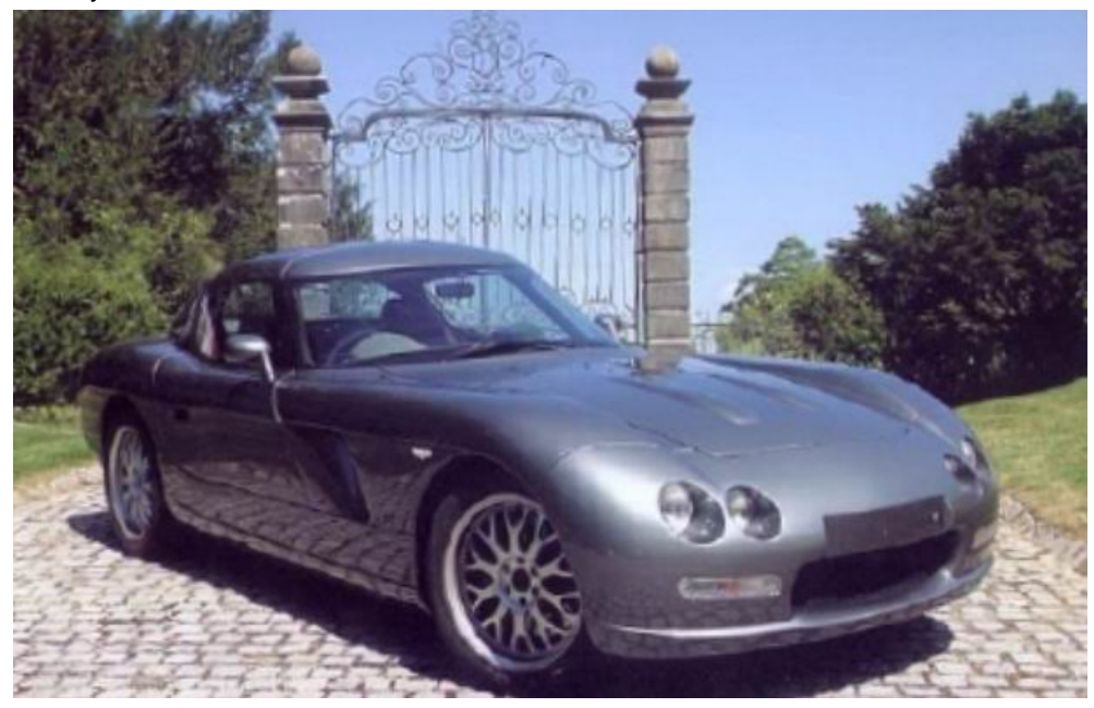
1949 Text from Motor Manual Annual with thanks.

Editor Comment: Now here's a bonus! Below is the latest 2004 Bristol Fighter , powered by a ten cylinder 525 h.p. engine – a true 'Gentleman's Express' built without constraint with respect to costs. Picture taken from Bristol Cars Ltd Website. As Audrey, in the BBC's ' To The Manor Born ', would have said – "Ohhhh — Gosh!"