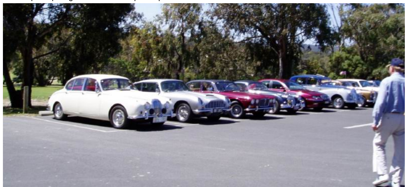
Cars basking in sunshine at Anglesea Golf Club, left to right – Daimler, Aston Martin, Jaguar XJ-6, Jaguar XK150, Rover, Armstrong Siddeley, Alvis, Rolls Royce (2). A fine variety of six and eight cylinder British engines.

While we had a superb lunch, we did see some kangaroos hopping around the practice green. It was in the car park that the participating cars were lined up for a photo session.