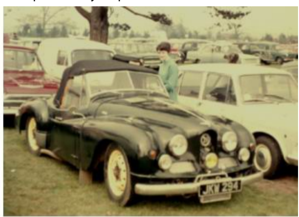
Same slide after moderate enhancement.

The Scanjet software very conveniently places scanned pictures (slides) into monthly files. I started scanning my slides at the beginning of August and, over the month, about 350 slides were scanned into that month's file. By trial and error, mixed with a spot of self education, I found the best resolution to scan the slides at to be 600 dpi. This is where it gets a bit computer digitalish what with dots per inch (dpi) and pixels, I elected to stay with dpi and found that for my purposes the setting of 600 dpi was the best for television viewing. A compromise has to be decided here, because the Scanjet 3570C is capable of scanning to 1200 dpi. This higher figure is all very well if you have plenty of time and sufficient hard disc space. At 600 dpi the scanning of a colour slide is a fairly quick operation, it also gives a good result from the resolution point of view. Another factor to be considered is the original picture quality with respect to focus, exposure, depth of field and lack of camera shake, because no amount of dpi and picture enhancing will help fix these problems.