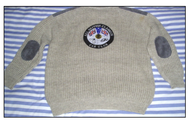
Front (left) and rear (right) views of the Jumbuk Jumper, note ABCCC badge patches and the leather shoulder and elbow protectors.

These super winter quality jumpers are crafted from wool that is unique in this country. Jumbuk Wools is the only company that manufactures naturally greasy garments, from washed fleece to finished product, under the one roof. Some lanolin is left in Jumbuk Wools to give you all the natural benefits – extra warmth, resilience and water resistancy. The wool is soft, springy and durable – it holds its shape well, yet is quite soft for you to wear.