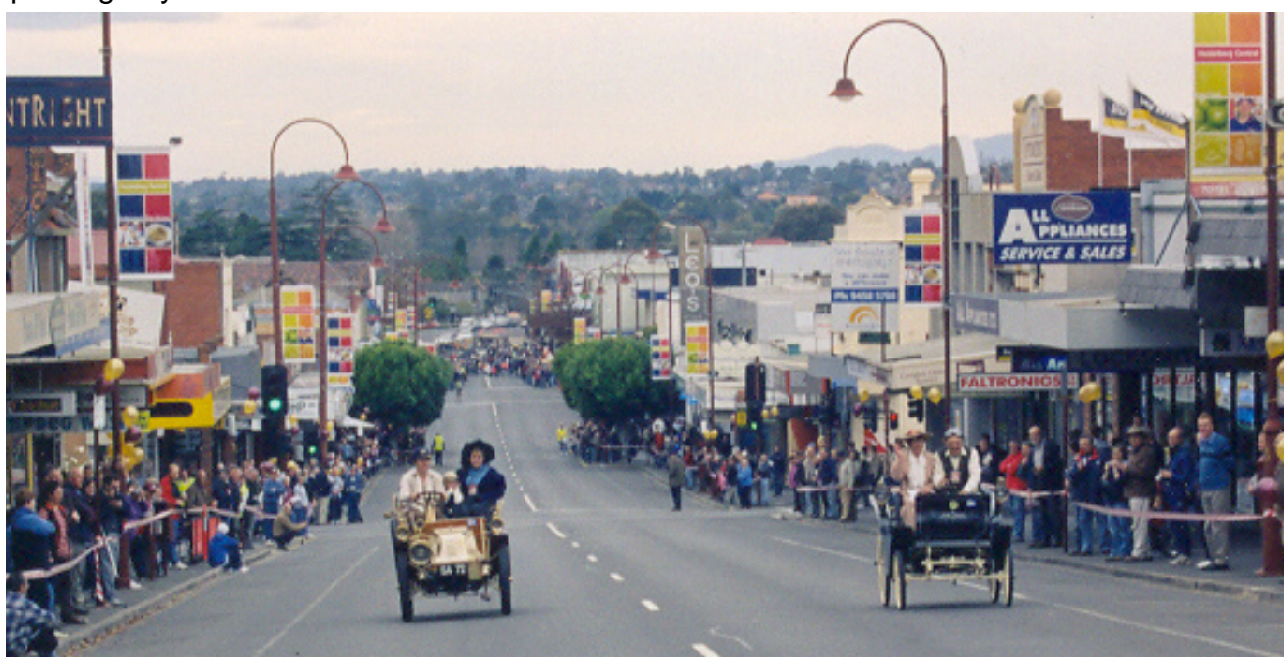
The exuberant thrill of your accelerational velocity on the hill!

Mount Street had also been closed off for a top of the hill gathering area. This worked very well, the modern two-way radio making it easy to send the cars back down safely at the end of each batch. In addition, there was a display of interesting motor cars of all ages and types arranged in the parking bays in Mount Street.