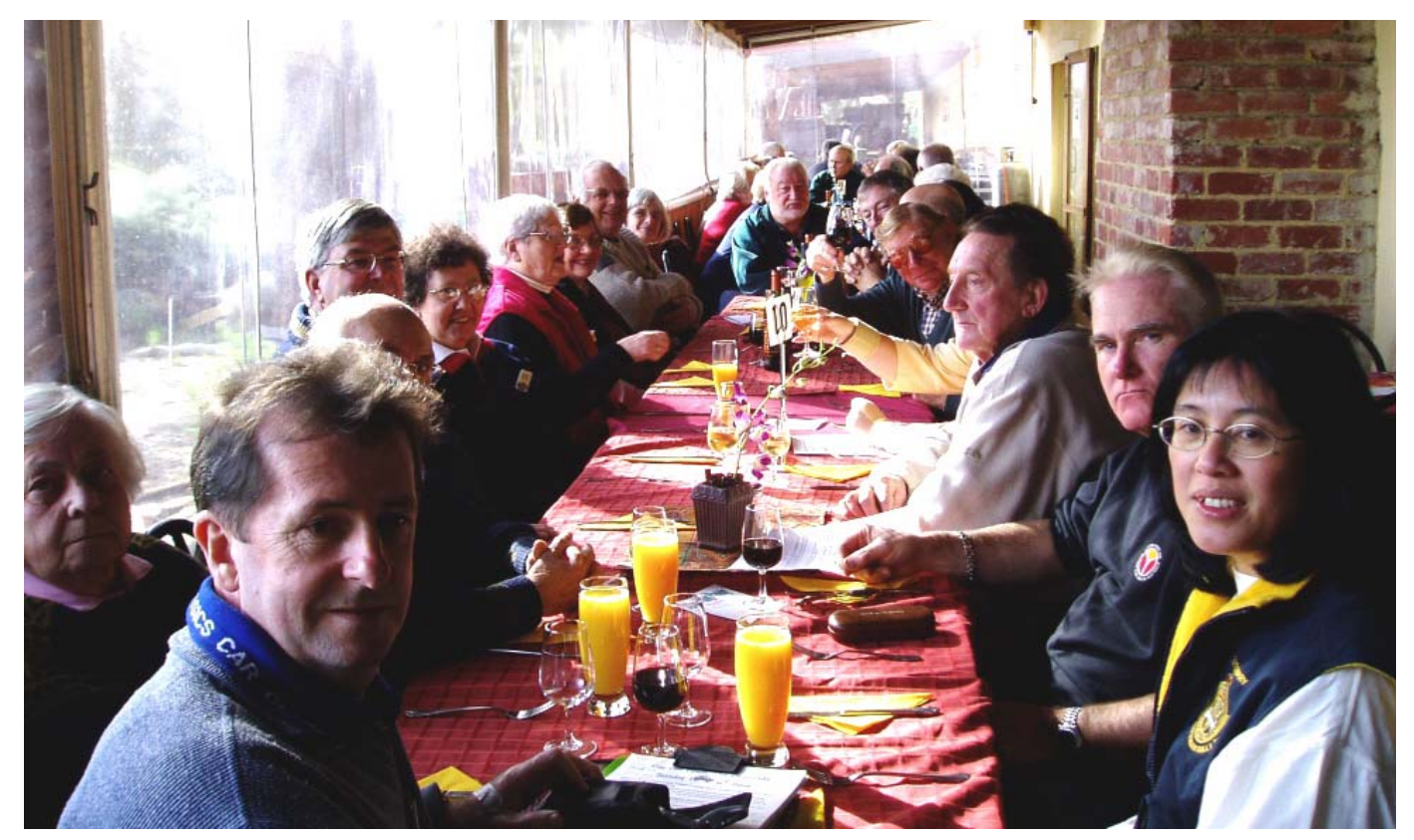
Just a part of our group enjoying the lunch

Mornington turned on a rather beautiful late afternoon and the folks at the Old Bank Café did us proud with 'low-fat, low-cholesterol' yummies (we took advantage of the ABCCC dispensation for calories) and some really good coffee. We were disappointed to find that the management of this fine and hospitable establishment doesn't do take out. The big bag of cheesecake and stuff that we had envisaged hauling away was not to eventuate!