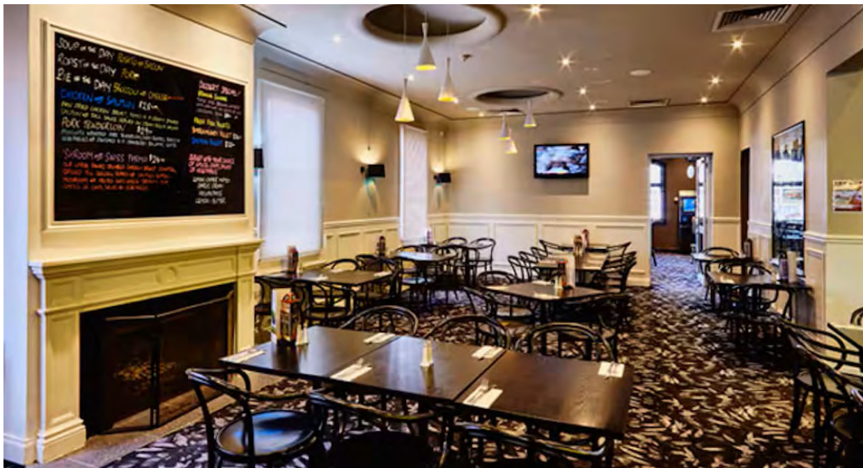
Crown Hotel interior