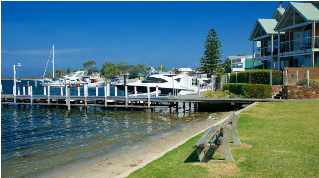
View of Metung

Departing Omeo on Tuesday 12 th May 2026 after checking out we will head to Bairnsdale. We have reserved 10 rooms at the Mitchell On Main Motel at 291-294 Main Street, Bairnsdale, phone number 51525012 for one night at a quoted cost of $160.00 per night. Wednesday 13 th May after checking out that will be the end of the organised tour, you can of course choose to spend a few days at Metung or Paynesville or both, enjoying the Gippsland Lakes.