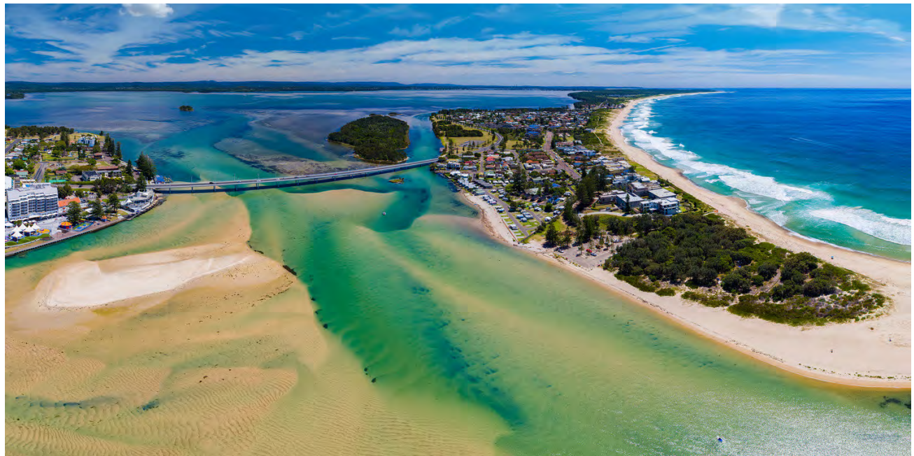
View of The Entrance