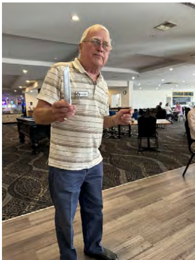
Just in case you have forgotten what he looks like, here he is!

However, I'm sure he will have plenty to say when he gets back from his sojourn.