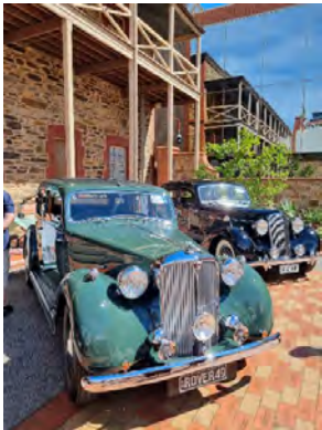
Rover and Humber