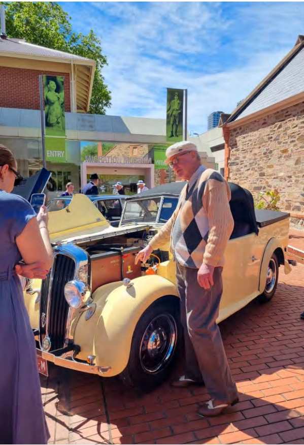
1938 Singer EV