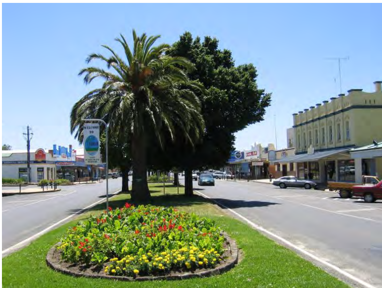
View of Yarram main street