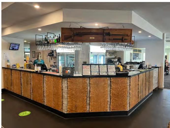
Upper Yarra RSL bar