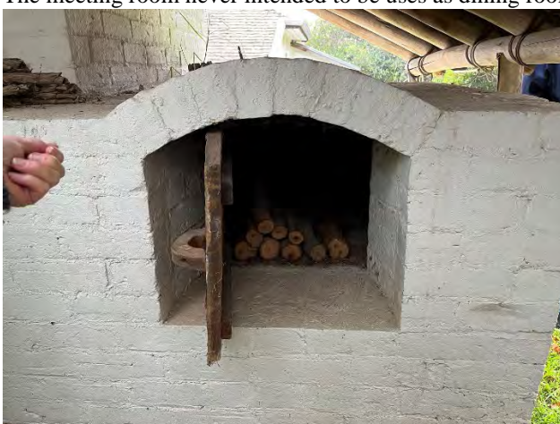
The outdoor wood fired bread oven.

The McCrae family were one of the first six pioneer families to establish properties on the Mornington Peninsula The meeting room never intended to be used as dining room