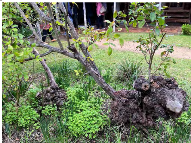
The original rose bush planted and still flowers