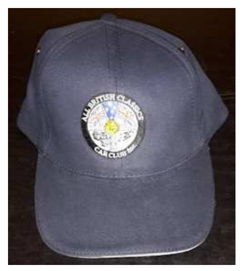
New Regalia – Club Vest, wind-proof, at left – $40.00 each, plus delivery. New Regalia – Club Polo shirt, above – $30.00 each, plus delivery. New Regalia – Club Cap, above right – $12.00 each, plus delivery.

We have new stocks of club apparel now in stock. The wind-proof over-vest, the polo-shirt and caps can be ordered by using the Contact Us form on the ABCCC Website, or direct from our Regalia Manager. Postage will be extra.