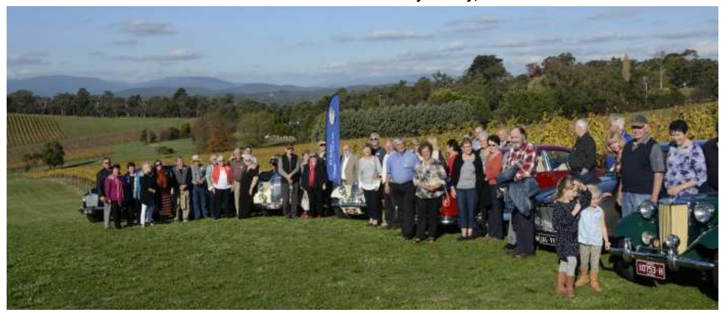
Victorians and Queenslanders mixing it with cars and vines. The two girls are 'ring-ins' from a chooks' day out.

Even though this event has been on our calendar of events since late last year, definite information about what was going to happen surfaced only recently. For our contribution, we organised a car display and lunch at Killara Wines Estate in Seville East. Our Queensland colleagues had escaped some pretty awful wet weather up north to come south and be greeted by a fine display of motor cars and a beautiful clear sunny Autumn day that only God's Own Country could produce. We arrived to find a NSW registered coach already parked and its passengers eagerly awaiting our arrival, and parked our cars facing the winery's dining area with magnificent views towards the Great Dividing Range. It was a perfect day and a glorious setting for our display. Marques represented were Austin-Healey, MG, Daimler, Ford, Dodge, Jaguar, Lagonda and Rover. A Jowett was an apology for this event. No matter, a fine display of British classicness was put on for our guests.