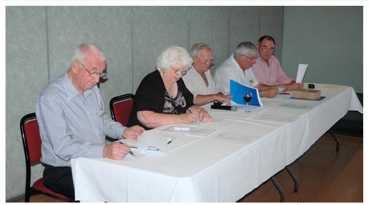
Our Executive Committee hard at work – Annual General Meeting, Sunday, 16<sup>th</sup> February 2014.