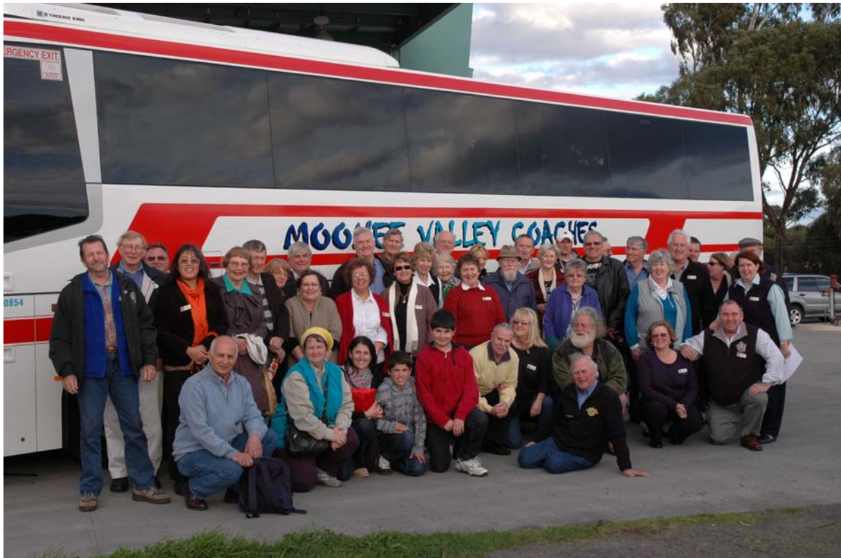
At journey's end – a happy and satisfied group of tourists.

Aha! Way down on the Mornington Peninsula it was to be for us. Very soon it became apparent that the efficient thoroughness of the Higginson Charabanc Tour Company, assisted by that of the well-oiled machine that is our ABCCC (morning tea stop), we were advised to find our sea legs because we had to meet the 11:00 am ferry from Sorrento to Queenscliff. What a day for a crossing of The Rip it was! Clear skies, clear coastal views. Our motor coach snuggled down on the motor deck, ready to be first off once the nautical trip was over. There was an astounding abundance of fresh air on deck with the crossing being smooth and effortless. There were fabulous views in the clear light, of the You Yangs, Arthur's Seat and the old guest house at Sorrento. We looked out for the recently reported whales visiting our bay, but alas they didn't appear. Soon we were safely docked at Queenscliff, and the 400 horsepower eased us up onto terra firma .