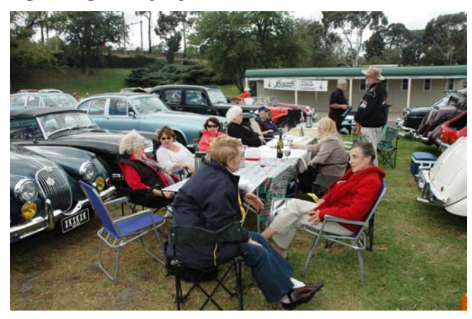
RACV Classic Showcase - Flemington