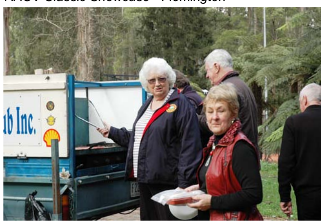
A Garden Day Out - Don't take that photo!