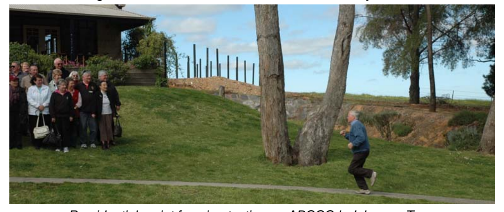
Presidential sprint for wine tasting on ABCCC Indulgence Tour.