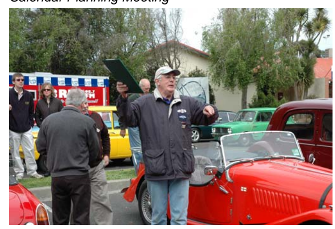
The man from Doncaster telling us all about the Peninsula!