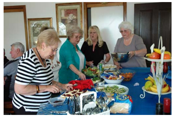
Calendar Planning Meeting