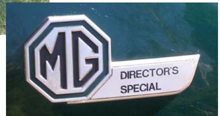
Right: Does the badge at the tailgate of the car give anything away?

(Amazing what can happen when you throw tons of hours & a bucket load of money at a car!)