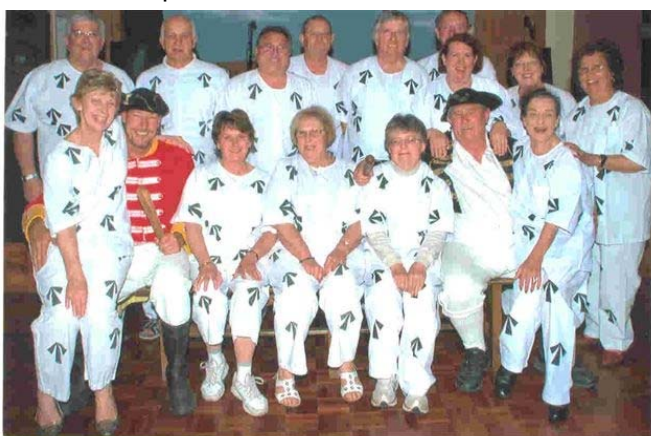
Above: A group of very replete and contented convicts!