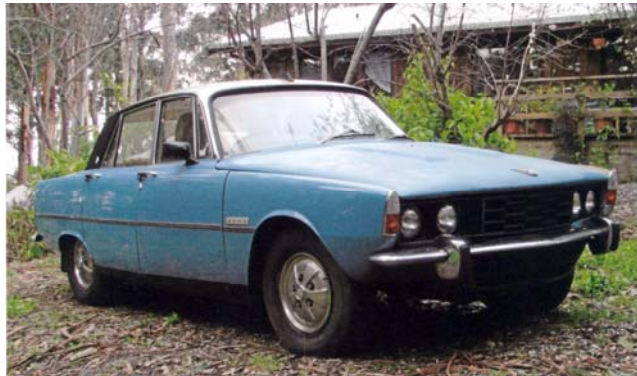
1976 Rover 3500 at left: Engine No. 45121966D

As promised, here is the sole remaining Rover 3500 that Bob Kilpatrick is offering for sale. The other two cars mentioned last month have already been sold. This Rover is currently stabled at Sale. Bob sent in the following description: