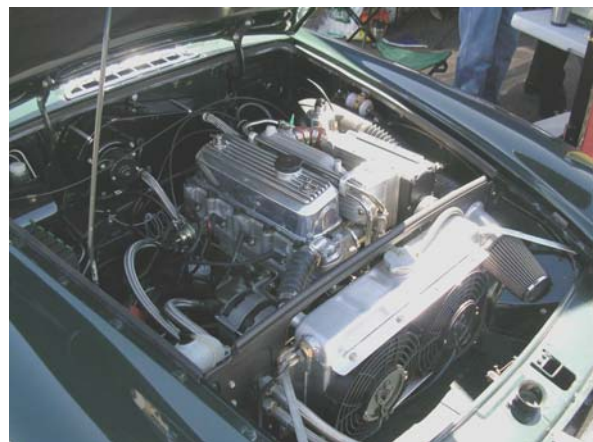
The getup & go dept!