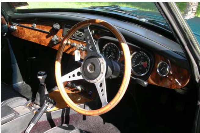
MGB with woodgrain? That's different!