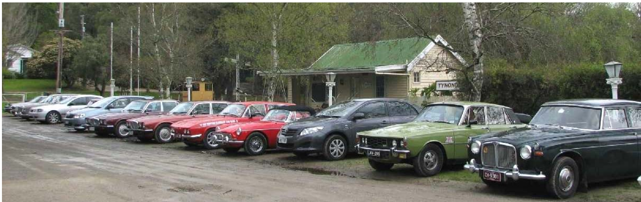
Our cars lined up outside the railway halt, sharing the damp gloom while we were snug indoors having lunch.

vaged, restored with adzes and now support the roof over a magnificent mounted stag's head on the kitchen end wall. This huge stag was from New Zealand, where they are regarded as pests, and was mounted with head swung to one side and mouth open for a lusty bellow – rather strange, but effective. There were more, lesser-sized stags in other halls too. The ranch is run as a youth camp and has been running for forty years.