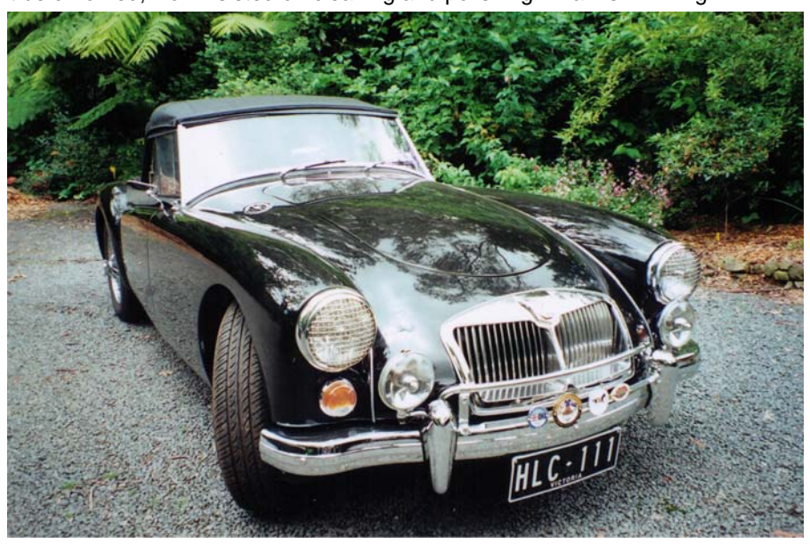
The expensive 'HLC-111' plate proudly worn by 'Black Betty'.

Together they worked over the next twelve months stripping and re-spraying the bodywork. Don showing that patience is its own reward and many trips to the local chrome plating establishment is never too much of a good thing. If it couldn't be chromed, Don insisted on cleaning and polishing. Thanks Mr Bling!