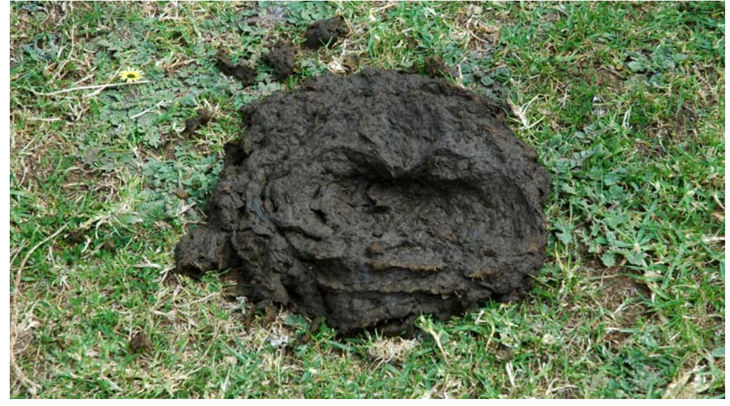
Watch where you step! Those who have been there, are wise to local obstacles! We wish you an enjoyable holiday, with a safe and clean return.