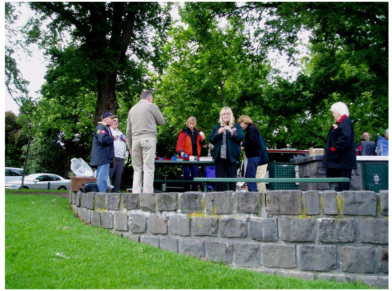
This was the morning when no egg whites blew right across Alexandra Avenue! This Image was taken from the river side of our breakfast area in November 2004.

The Editorial Images File is now reasonably well stocked, and goes back far enough, for us to share some of those Magic ABCCC Moments. The fifth in this series, below, shows our group enjoying breakfast prior to setting off on a lap of the Bay in the Higginson Charabanc Tour Company's 420 horsepower motor coach. It has to be recorded again that the Higginson Super-hot Barbeque equipment coped admirably with the variety of breakfasts being cooked. Our German guests for the day must have wondered at our eccentricity in having breakfast out in the open air, right by the City. They enjoyed our outing just as much as we did.