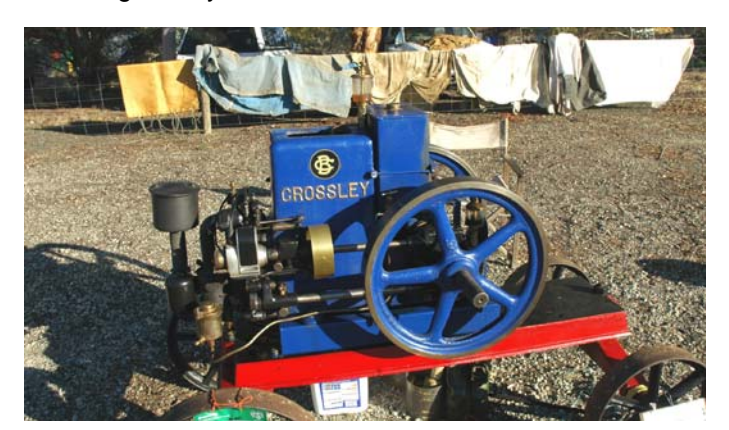
Above: The lovely little rhyme and a splendid Crossley engine.

Some are red; some are green Some are colours in between Some go "chugg"; others putter Some just sit and spit and sputter Some shine up for all to see Some are rusty as can be Some run smooth with click and clack Some puff smoke rings from the stack Some keep chugging or snap and pop Some just quit; their flywheels stop Some are pains; we hate to move 'em Some are friends; we dearly love 'em.