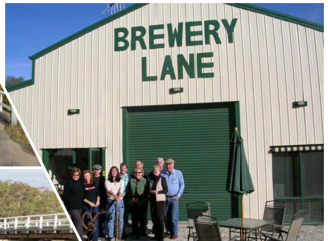
Above: Rusty Springs