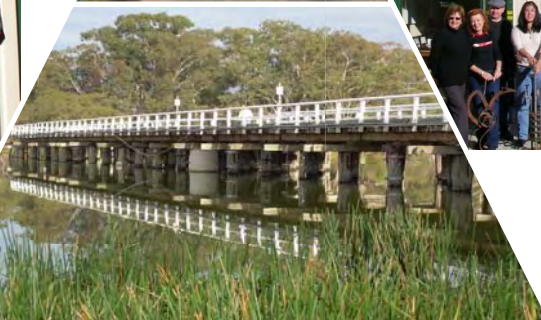
Left: Kirwans Bridge