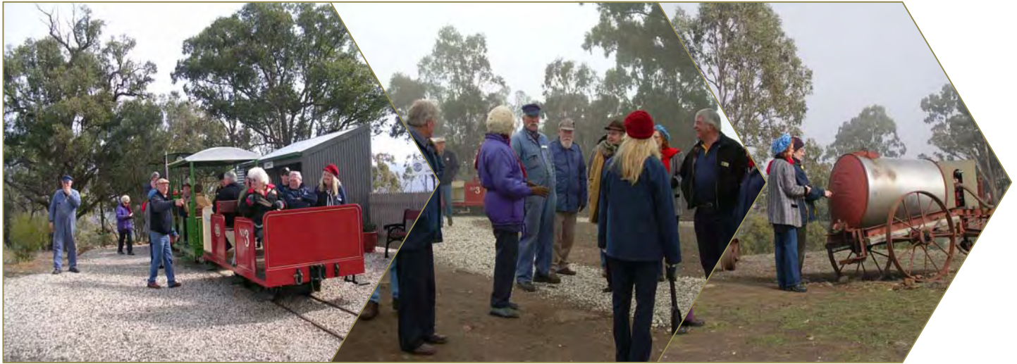
Above: Kerrisdale Mountain Railway