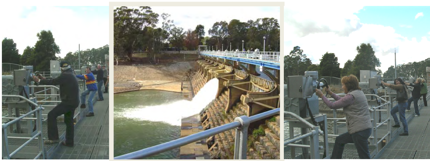
Above: Get ready, set, go! Girls against the guys. Goulburn Weir.