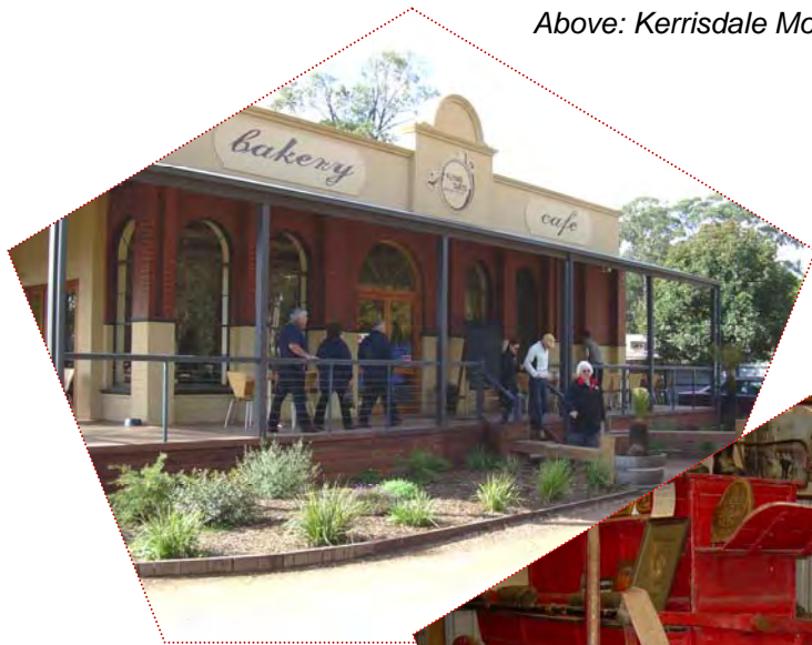
Above: Flying Tarts Bakery