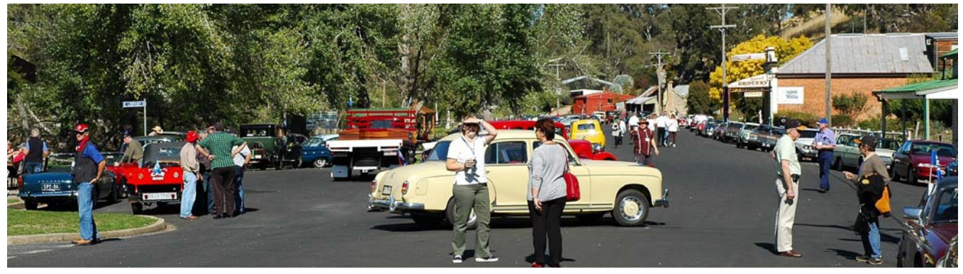
Above: Harrow, filled with heritage cars and trucks.

The big one! Pynsent Street was closed off for our flag-off ceremony and, after a bountiful breakfast in the Town Hall, we were ready for the start to a day of super-perfect touring. The actual flag-off was arranged so that ten cars at a time entered the roundabout in Firebrace Street where the police obligingly assisted a very smooth flow of Tour cars towards the primary school where the youngsters enthusiastically waved flags to friendly toots from many car horns. It was a perfect sunny morning as we headed along the Wimmera Highway towards Natimuk. We soon spotted the Tour Direction Sign at the turn-off for Balmoral. We had the lonely roads to ourselves. The drive to Harrow was just magic. The roads were good and we were soon there for a pleasant morning tea. The wonderful ladies from the Harrow Bush Nursing Home ably sold us good refreshment in aid of their Home.