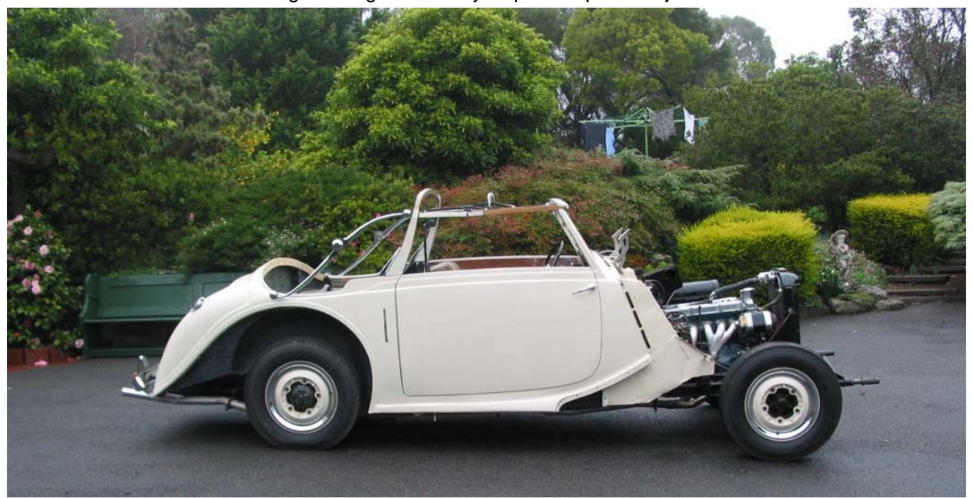
Handsome progress! The elegant drop-head coupé frame work can be seen.

Another, more critical concern, is the ride height at the front of the car. It can be seen in the photograph that the front seems to be sitting a bit high. This may require a spot of adjustment.