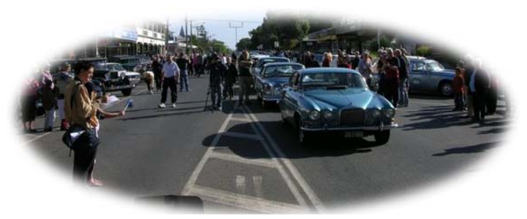
Above: A great send off from Kerang.