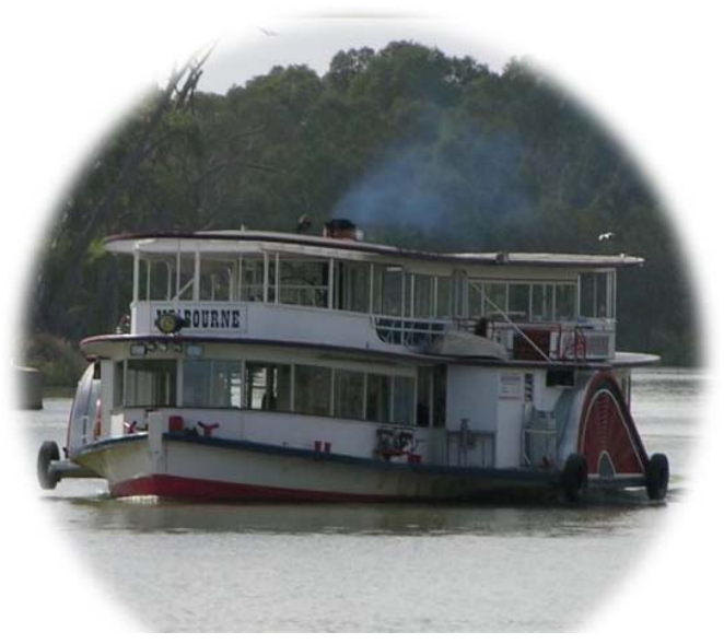
Above: Our transport to dinner at Trentham Winery in Mildura.