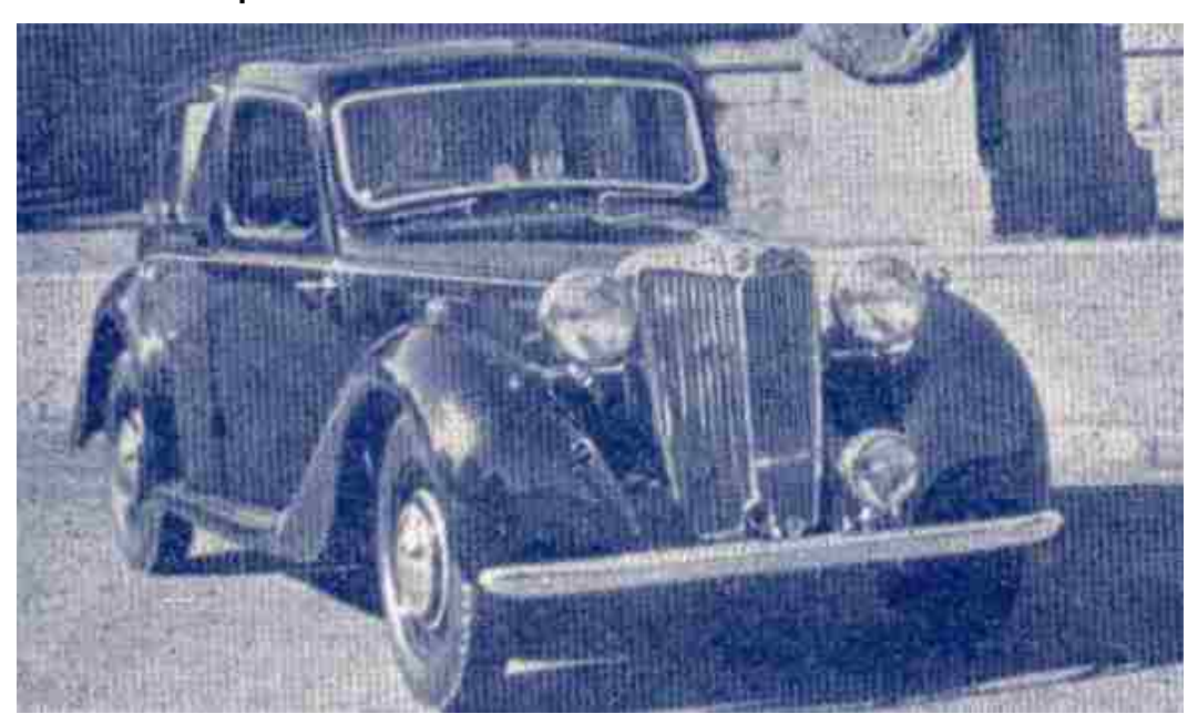
M.G. 11/4 Litre 11 h.p. Saloon

A post-war introduction that is an "all-rounder" as far as saloons go, being full of comfort for the family, yet offering a lot of interesting motoring for the man who is attracted by the car's sporting characteristics and fast cruising speed, this being 70 m.p.h. from its 11 h.p. 4 cylinder O.H.V. unit. It has been engineered for good mileage and its one S.U. carburettor which will deliver 33 m.p.g. at 40 m.p.h. Imported saloon coachwork has most extras as standard – the fog lamp, sunshine roof, opening windscreen and other luxury accessories. These include four wheel jacking, independent suspension and high grade leather upholstery.