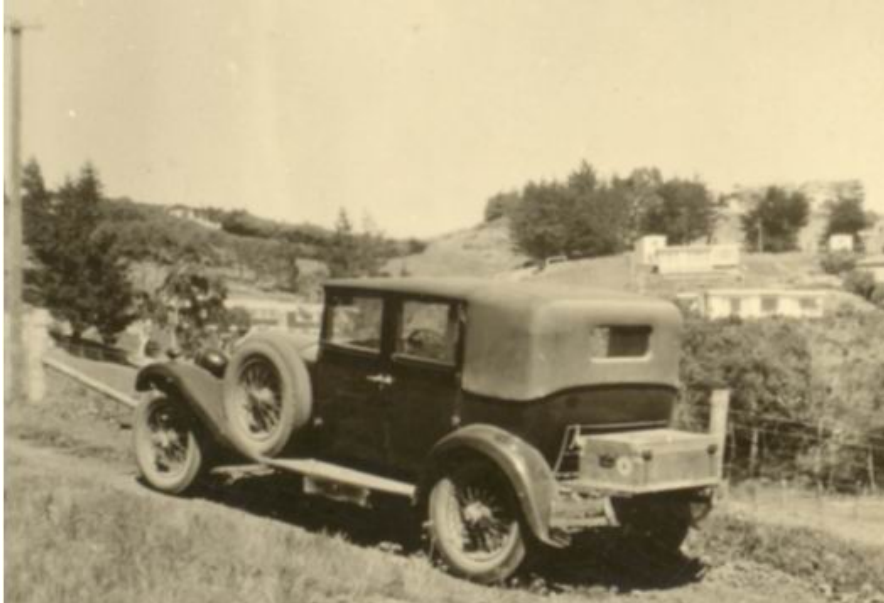
Our Bentley in 1949 on our property at Mount Pleasant.

There was no chance at all of getting a new crown wheel and pinion set from England, so the workshop pegged and welded the broken tooth back on to its wheel. Fortunately it had broken off cleanly and had not become caught in the gear teeth. The repair work took quite a while, and we made lengthy visits on our way home to Mount Pleasant. Until our family started running Daimlers, my mother never got on really well with my father's choice of car. She was quite apprehensive about the purchase of a broken down Bentley in such difficult times. Finally we collected our Bentley and I showed it off to my mother and my sister. All apprehension was soon thought no more of as the car performed its first trips. The back axle was carefully run in and soon we were able to enjoy a larger petrol ration and make a few long trips.