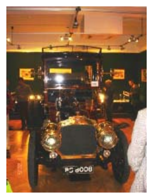
A 1904 Societe Manufacturiere d'Armes 20/30hp Open-Drive Landaulette (as pictured) brought £130,000. The following day Regent Street was closed off so as to permit a Concours of about 110 vehicles. The display was totally unbelievable with many of the owners dressed in the attire of the 1900 period.