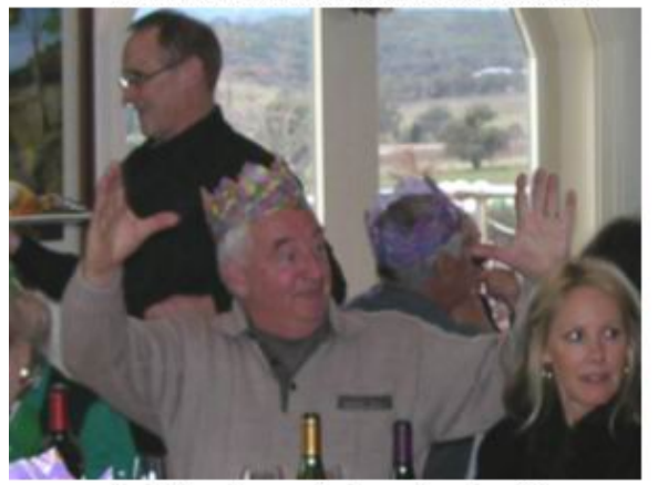
3. Is it really worth bragging about?