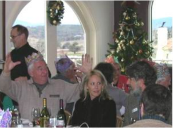
4. Some don't believe it!