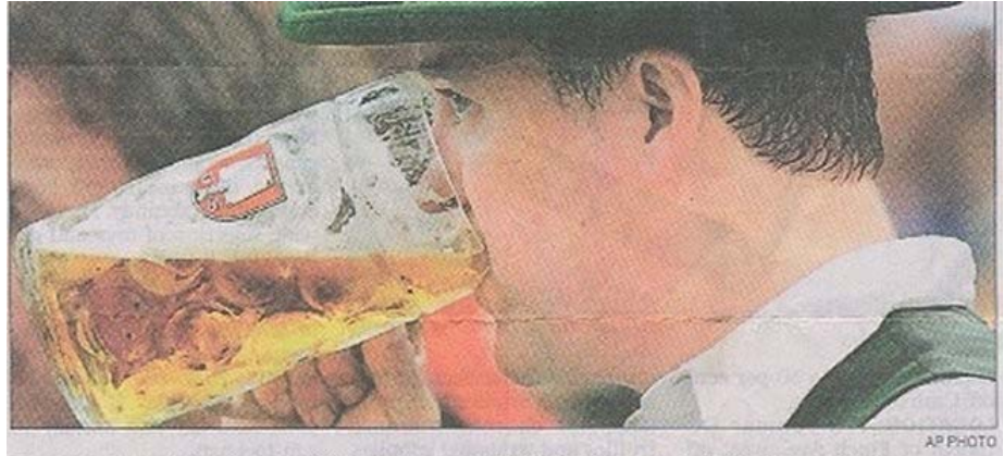
Bavarian men might want to rethink their annual Oktoberfest revels in light of a new study.