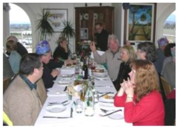
2. It must be quite something!