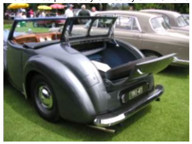
Page 11 of 14

Slowly I stripped the car down, taking many still and video pictures as I went. In addition, I made many notes and drawings of how components should be at assembly time. There was no other car to just pop over and have looks to see how it all should be. At this time, I joined the Triumph Your ABCCC News – March, 2005