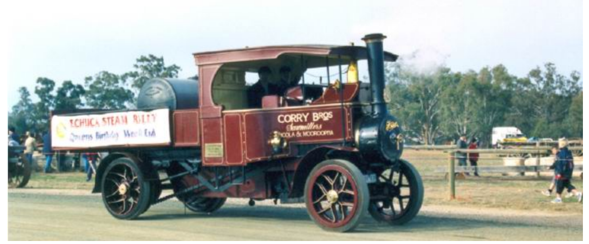
At the Rotary Steam Rally, Echuca.