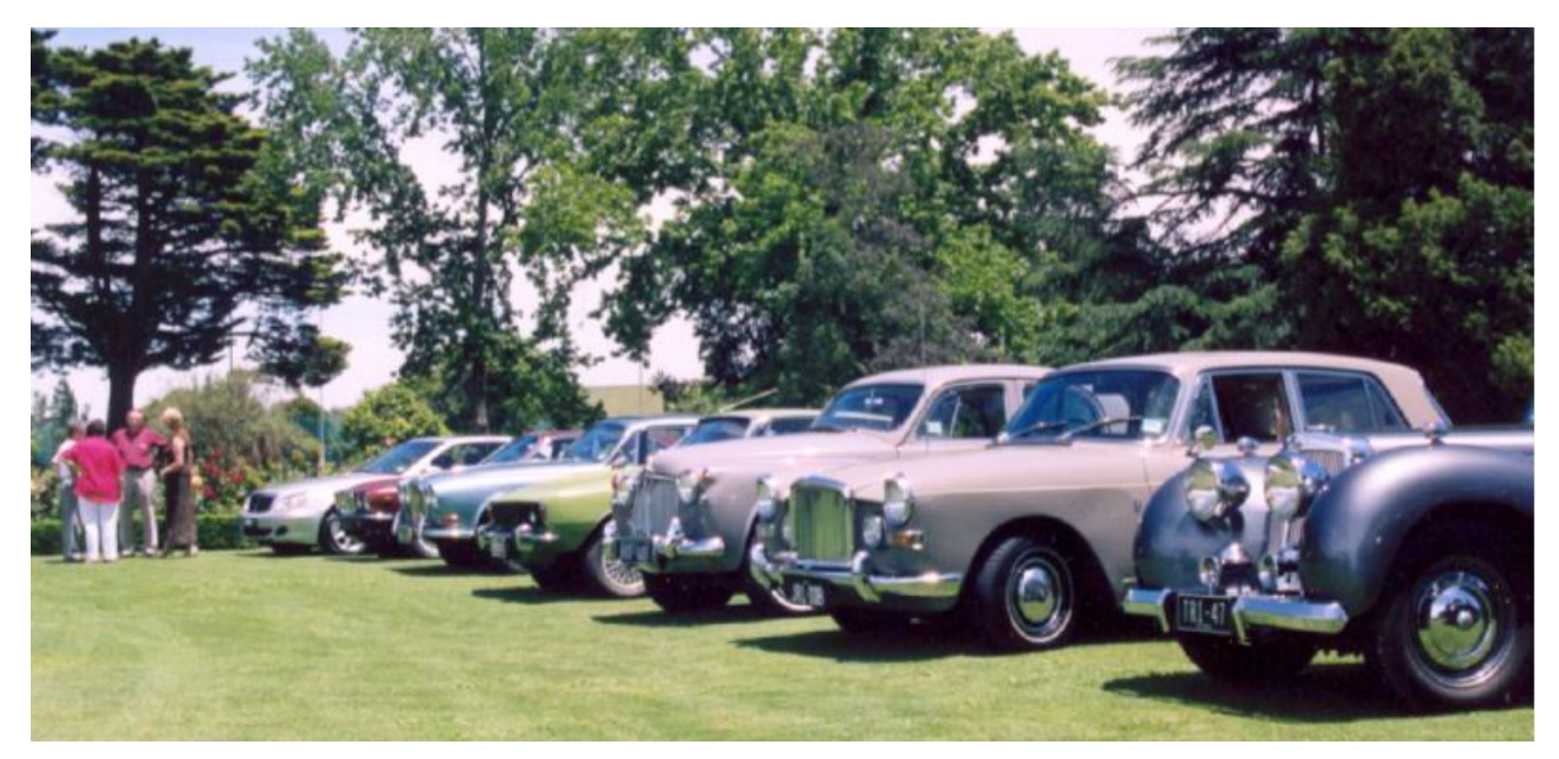
Line up of fine British Classics, the modern German sneaked in somehow!

A wonderful lunch was enjoyed by all, the chicken pieces were exceptionally delicious. After the meal our President gave an oration thanking those who had helped make the year's activities so successful and a special welcome was extended to our visitors from England. Then we spent time admiring the cars lined up on the lawn. There were splendid examples from Rover, Jaguar, Triumph, Van den Plas (Austin), MG, HMB, and, a Euro ring-in, Mercedes-Benz. There were some others parked under the trees that the writer can not accurately remember. Apologies for missing any margues.