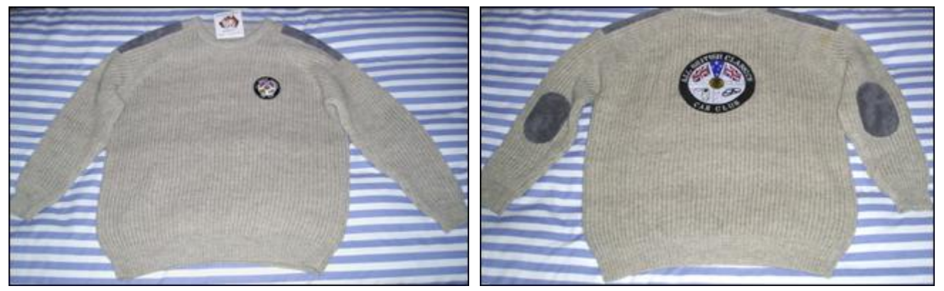
Front (left) and rear (right) views of the Jumbuk Jumper, note ABCCC badge patches and the leather shoulder and elbow protectors.

Pictured below is a superb pure wool, hand crafted Jumbuk Jumper, just right for those winter days, and on Spirit of Tasmania's deck during crossing. These jumpers are made especially for the ABCCC and there is an exclusive offer on them for our members.