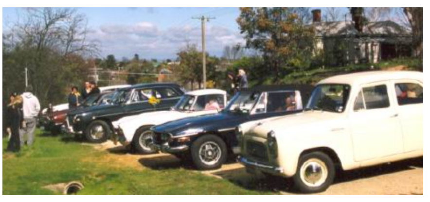
Some of the cars lined up outside Buda House.

Here were presented with a comprehensive goodies bag with brochures and snacks. Soon, it was time to drive on to Castlemaine, the objective of our day's activities. Our first stop was for a guided tour of Buda House, up on the hill overlooking south-east Castlemaine.