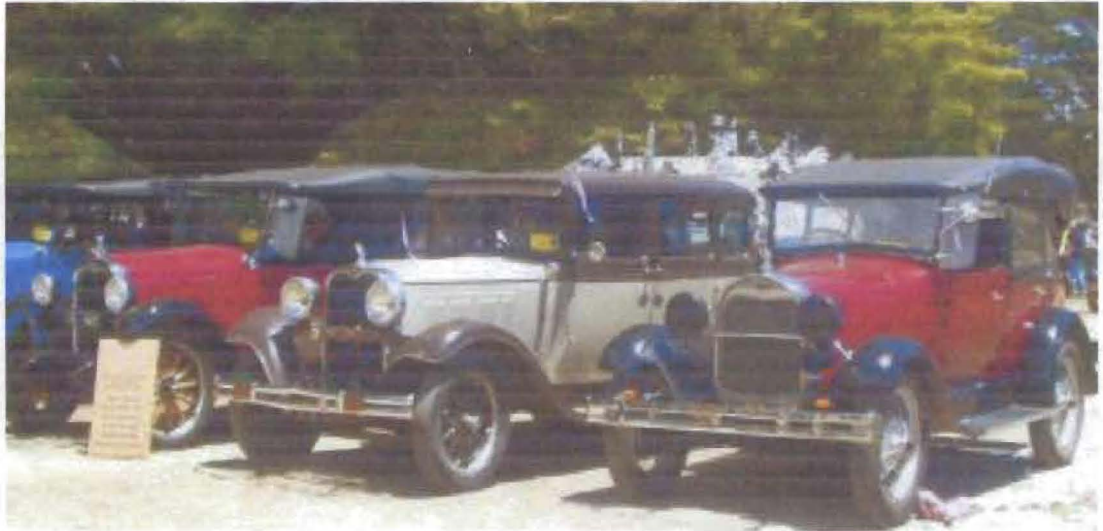
Pictures from the R.A.C.V. Great Australian Centenary Rally 2004 held on Sunday 18th January are featured here and throughout this edition of your ABCCC News