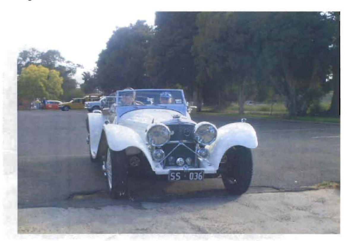
Jim Spence's Standard