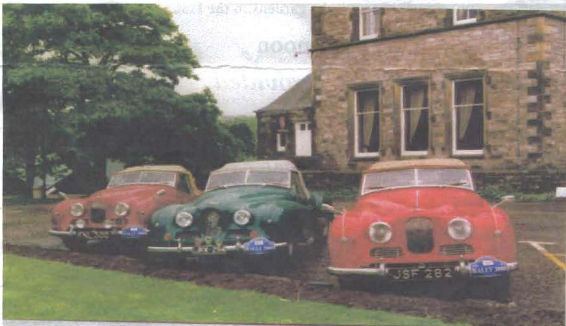
Our Jupiter in the middle, Pitlochry, Scotland 2000 (the last time these three had been together was in 1968).

In the mean time, through the Jowett Car Clubs and the Jupiter Owners Auto Club a great amount was found out about my car and Jowetts in general. It has the 42 nd chassis made, and has the 6 th body. Interestingly, there are a few oddities such as; the wooden door cappings and dashboard all have a '6' written on the unseen faces. However, one door capping has three screws to fasten it, the other has four! It was also established that it was finished in December 1950, despatched to Holland as a demonstrator, used by a Dutch team starting from Oslo (Norway) for the Monte Carlo Rally in January 1951. It was later returned to Jowett Cars Limited who updated it and sold it as a new car. We have owned the Jupiter since October 1963, so it has been in our care for most of its life. For the Jupiter's 50 th birthday, we took it to Scotland and to Le Mans for the big celebrations – but that's another story.