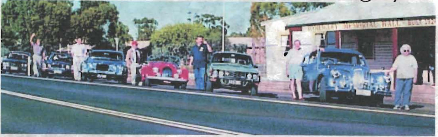
ABC Interclub dinner at the CrossRoads Hotel