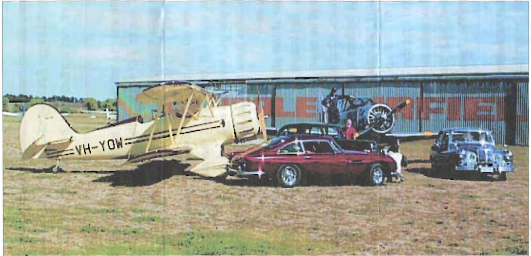
Photo-shoot at Lilydale Airport so the RACV could distribute photos to magazines, newspapers etc for the Wings & Wheels