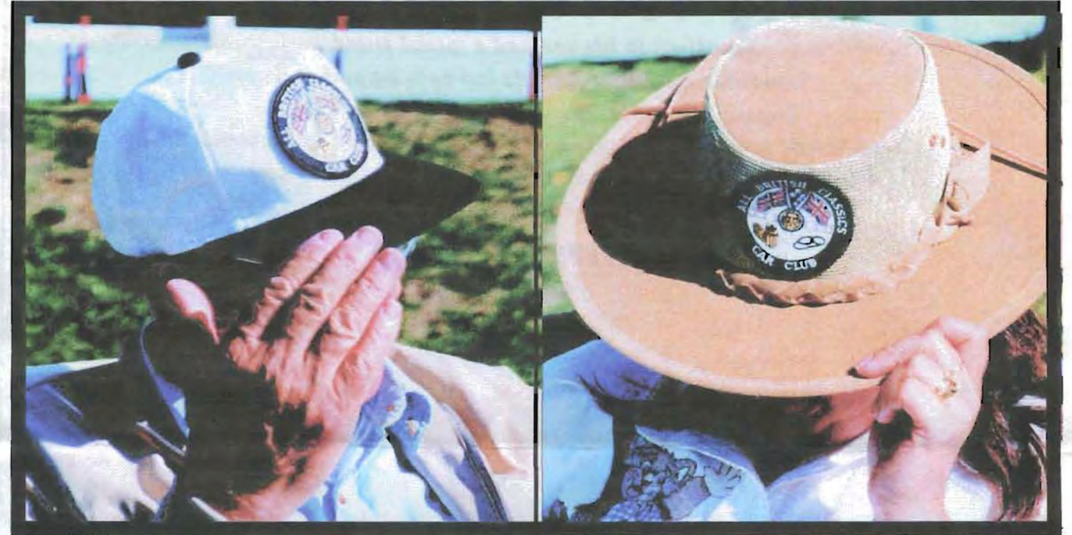
H.... C.... H.... C....